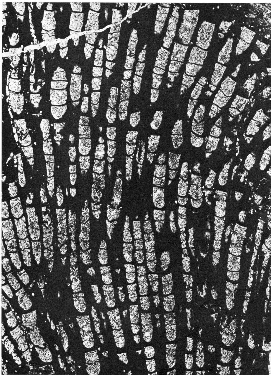
Fig. 3. Acanthochaetetes sloveniensis n. sp., longitudinal section, 17\times